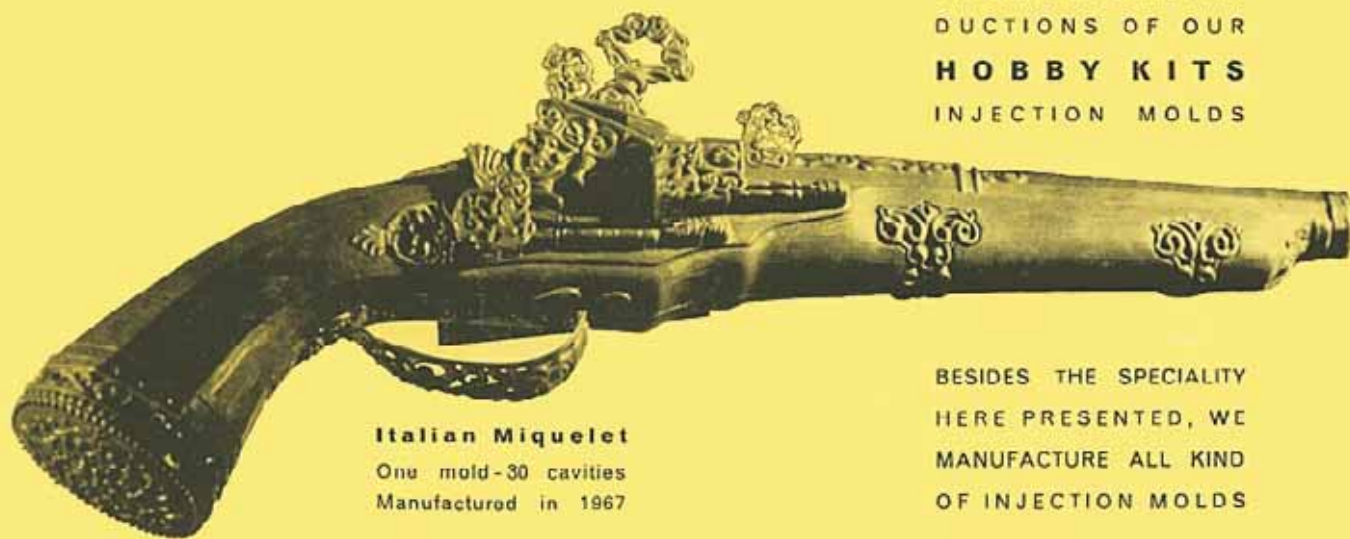
Italian Miquelet One mold-30 cavities Manufactured in 1967

R. DO HEROÍSMO, 291 ARMAZÉM-1-TEL. 51185 - PORTO PORTUGAL